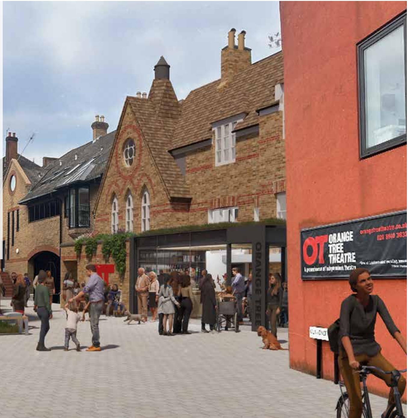
Artist's impression of the future of Clarence Street