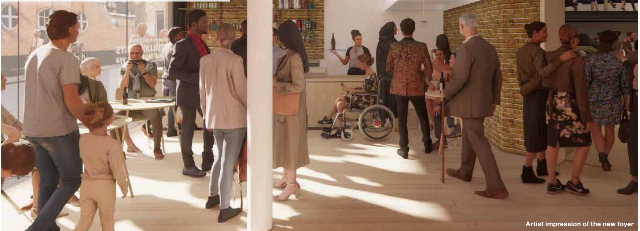
Artist impression of the new foyer

Construction is planned for 2026, and we will continue to produce work in the theatre throughout this time.